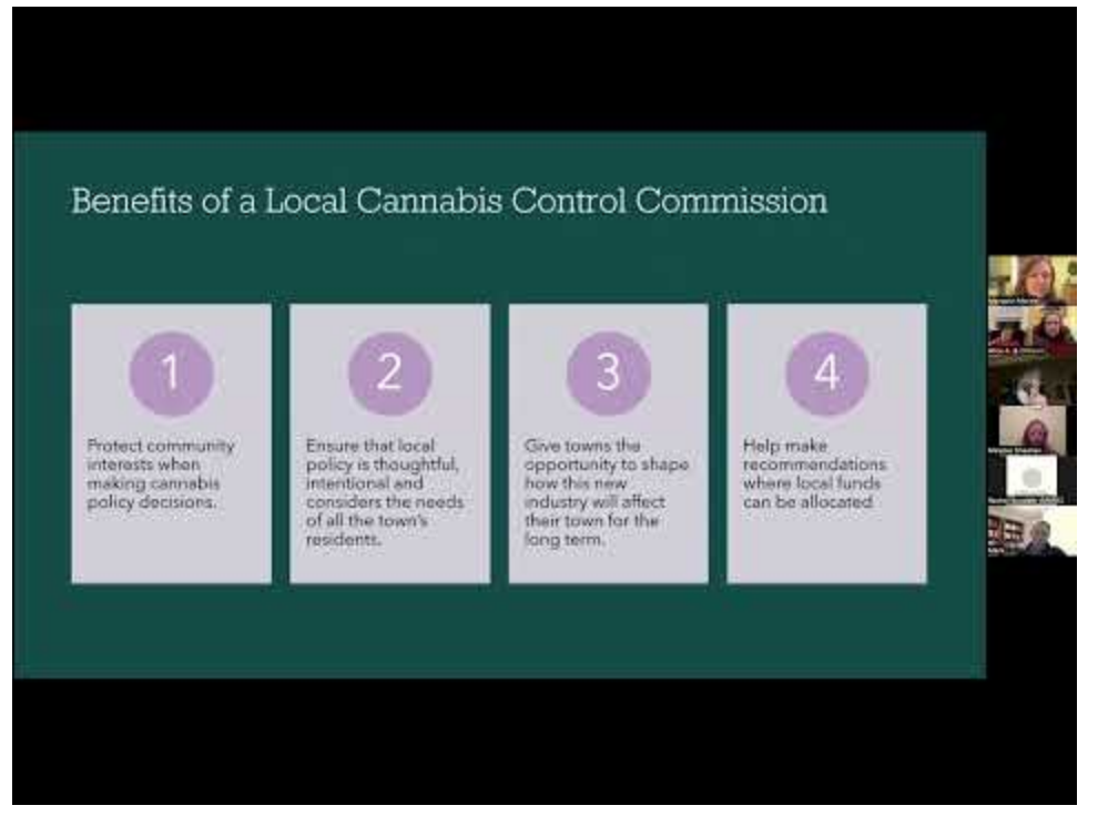
Watch Video At: https://youtu.be/pxbRKO6i_ok

On Monday night, Green Peak Alliance held an meeting regarding the vote, including actions that municipalities can take to regulate retail sales, information on the law and the Cannabis Control Board, which is making the rules for how the law will be implemented. That presentation can be viewed here by clicking the image to the right .