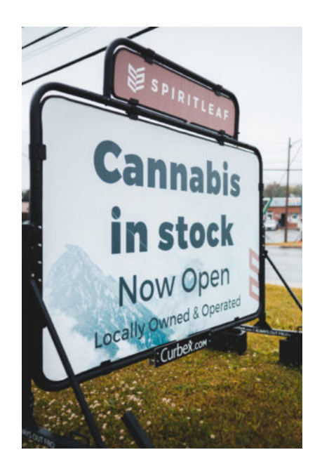
Signage is among the items that municipalities can regulate.

legislature return 1 to 2 percent to the participating municipalities. Towns could also enact a local option tax, which would be added to the sales tax in that town.